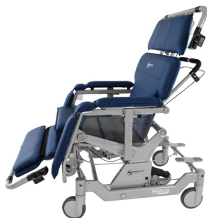
The Convertible Chair I-400