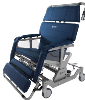
The Convertible Chair I-700