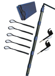
The Convertible Chair Patient Transfer System kit