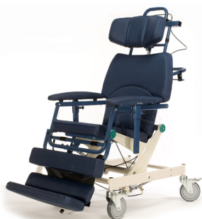
The Convertible Chair H-250